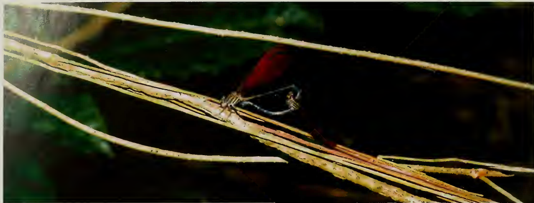
Fig. 5. Polythore spaeteri , spec. nov., male (holotype) and female (allotype) in copulation.